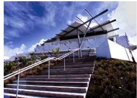
Puke Ariki Museum and Library, from "Puke Ariki - About Puke Ariki"

According to the "Puke Ariki - About Puke Ariki" page on its Web site, the Puke Ariki Knowledge Center, in New Plymouth, New Zealand, is a fully integrated library, museum, and visitor information centre. Full integration allows the institution to display the museum collections in an interactive way and enables the Knowledge Center to tell the story of the region.