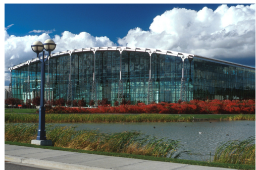
Library and Archives Canada, Preservation Centre, Gatineau, Quebec.