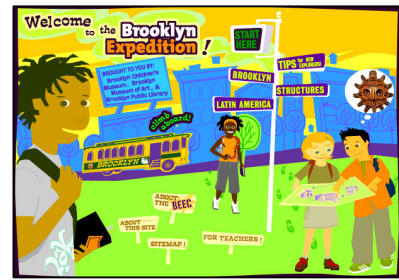
Screenshot of the Brooklyn Expedition homepage: http://www.brooklynexpedition.org

This partnership consists of a web archive of photographs, newspapers, maps and other digitized documents in the collections of the Colorado State Archives and the Denver Public Library, and other local historical societies in Colorado (Walker and Manjarrez 40).