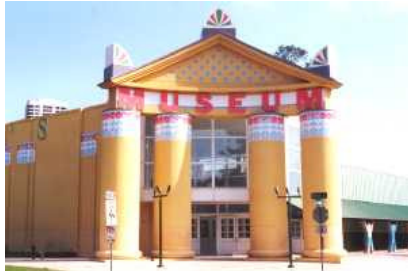
Parent Resource Library, from "About us: The Children's Museum of Houston"

The Parent Resource Library, located in the Children's Museum of Houston, opened in the spring of 1999. Operating as a branch of the Houston Public Library, the library aims, according to the "Parent Resource Library - The Children's Museum of Houston" Web page, to be "a complete resource for parents on all early childhood issues and concerns." Subjects covered in the collection include potty training, cultural issues and discipline. The library also maintains a resource list of other community organizations offering support for parents and families.