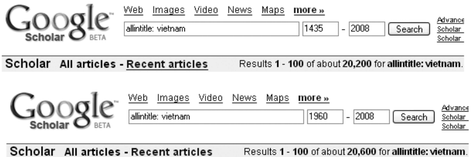
Figure 7. The shorter the time span the higher the hit count

The upcoming issues will look at the theory and the practice of determining the h-index in general, and in Google Scholar, Scopus and Web of Science in particular.