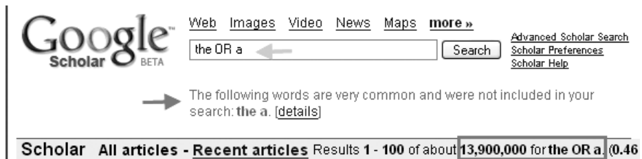
Figure 2. Unorthodox Boolean OR which reduces the original set by 99 per cent