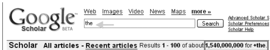
Figure 1. Hit count for the definite English article

As for subject areas, they should not be used as filters. When entering the search for any documents with the word “Vietnam” in the title, and the radio button for all subject areas turned on, Google Scholar reports 135,000 hits, an impressively high number. When sending the query through the advanced template, Google Scholar inserts two spaces in front of the search term. If you change it to one, the result will go up to 137,000; if you eliminate both spaces the result set will revert to 135,000 items. This is not true for field-specific searches, such as author, title, journal name. This will be the